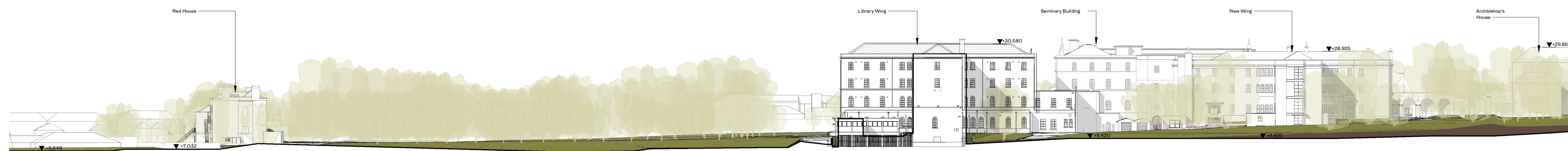
3 Section C-C - East West Road Existing 1 : 500