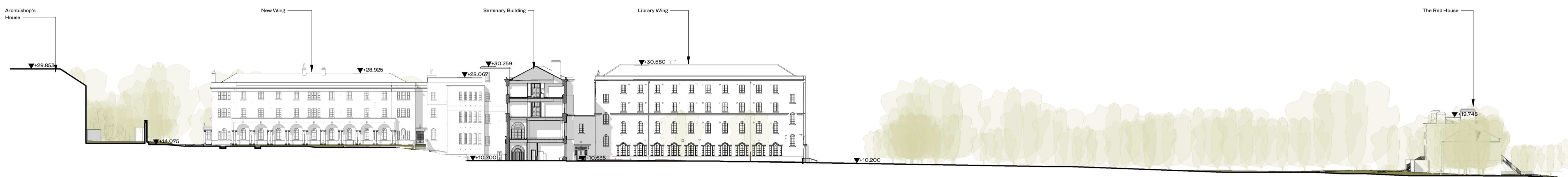
1 Section A-A - Formal Lawn Existing 1 : 500